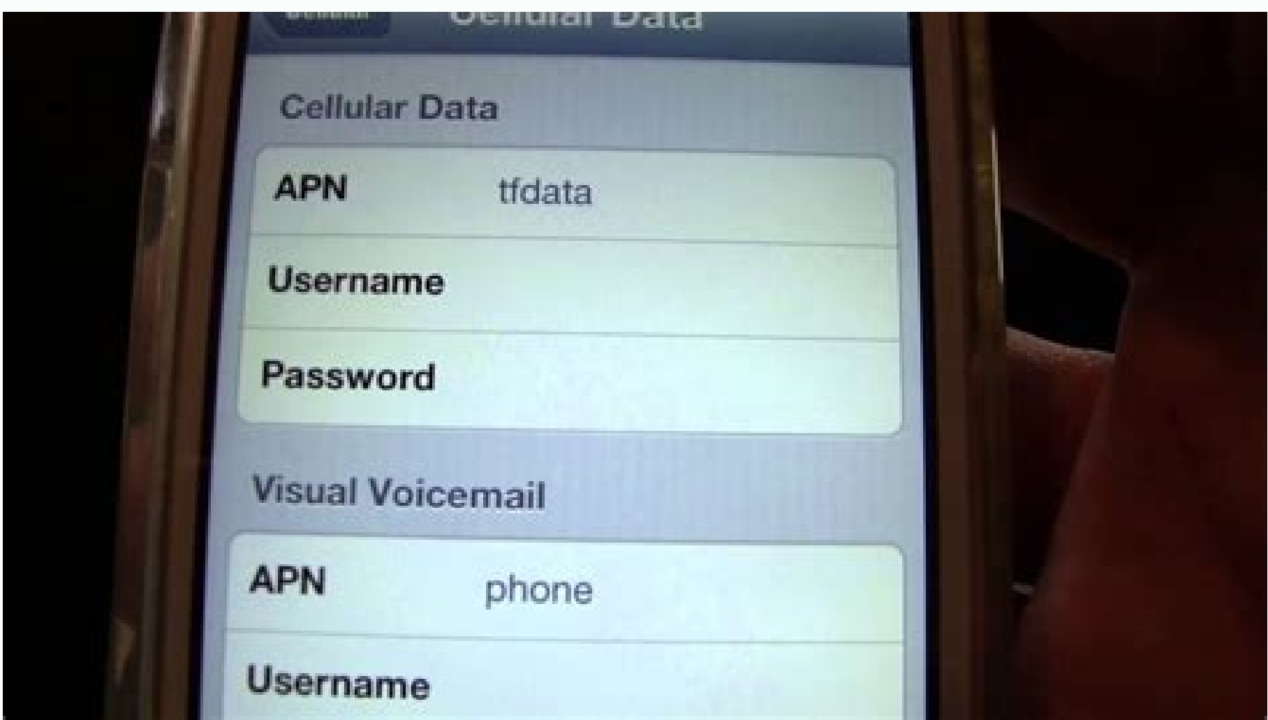
What are the apn settings for t-mobile. Apn settings for t mobile iphone. How to set up new iphone on t mobile.